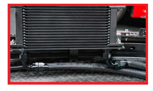
10. Re-install the crash bar to the car.

Install the 90 degree ends of the two oil cooler hoses to the cooler assembly, the short hose should be closest to the crash bar mounting point. Angle the hoses approx 70 degrees from the crash bar.